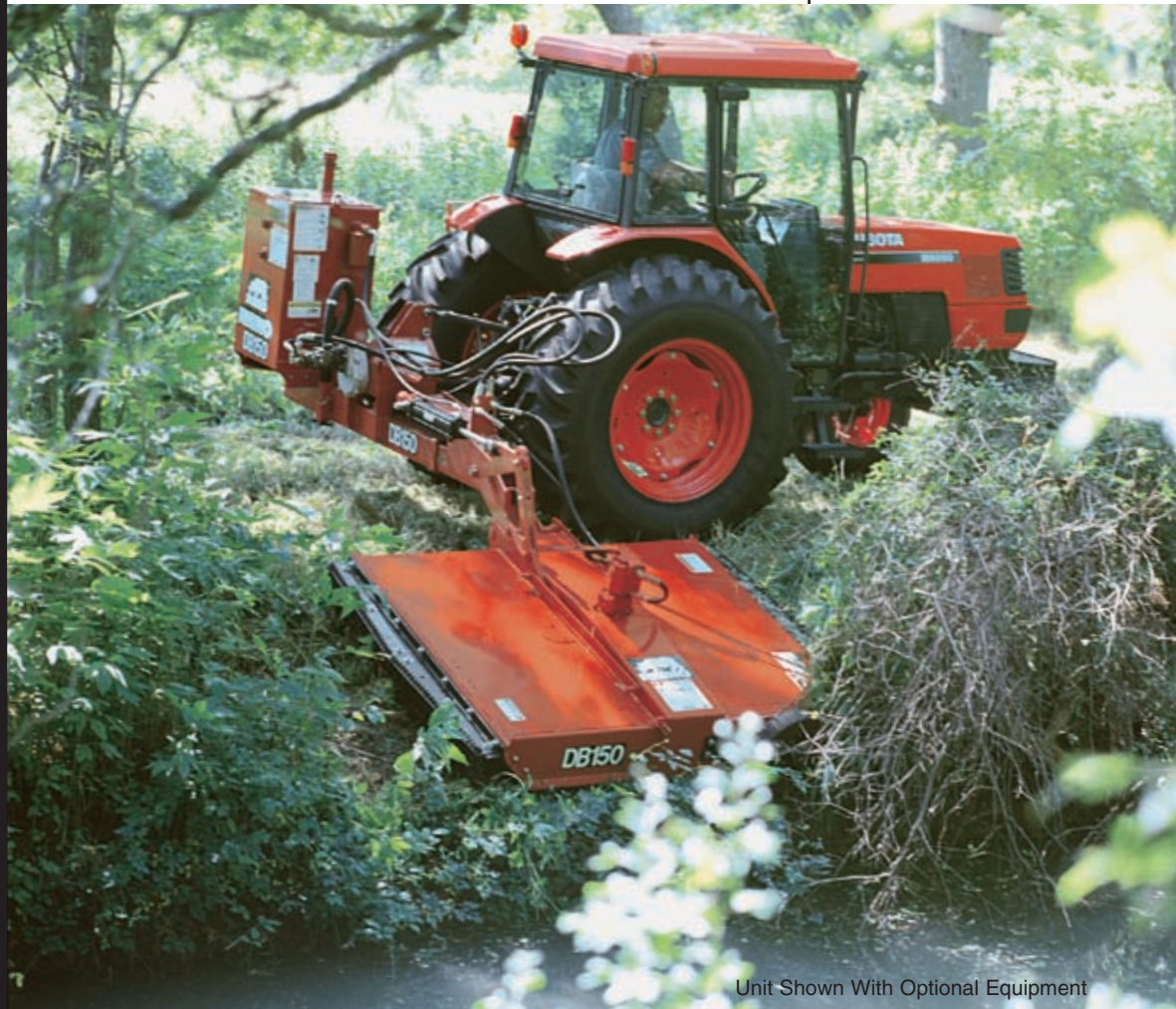
Unit Shown With Optional Equipment

The DB150 can extend to a maximum of 158" from the center line of the tractor allowing the 60 inch rotary head to cut areas that are difficult or impossible to reach with ordinary mowers. By being hydraulically driven, maintenance is greatly reduced with the absence of belts and pulleys. The DB150 outperforms many competitive units with smaller hydraulic systems. The DB150 utilizes a large (60 gallon max.) hydraulic system which allows the unit to run cooler in tough mowing conditions. The large reservoir also serves as a counterweight and remains stationary on the mainframe, eliminating the potential traffic hazard of a movable counter-balance weight. The DB150 features a heavy-duty three-point hitch using a lower double lug hitch system to fit a wide range of tractors. To help insure a clean cut, the DB150 features updraft blades and a blade tip speed of 20,028 FPM.